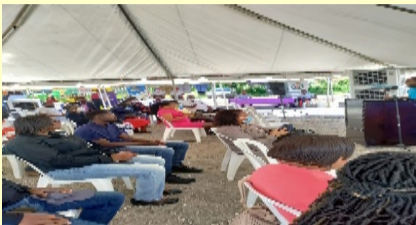
Presentation at the Saint Elizabeth Justice Fair 2022, to which members of the Legal Aid Council were participants.